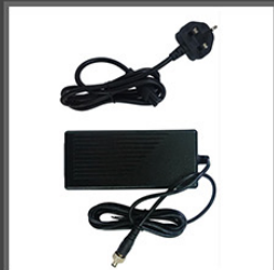
12V 3A Power Adapter

Backward compatible with Full HD/HD/SD signal formats