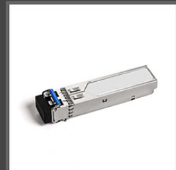
Fiber Module (Optional)